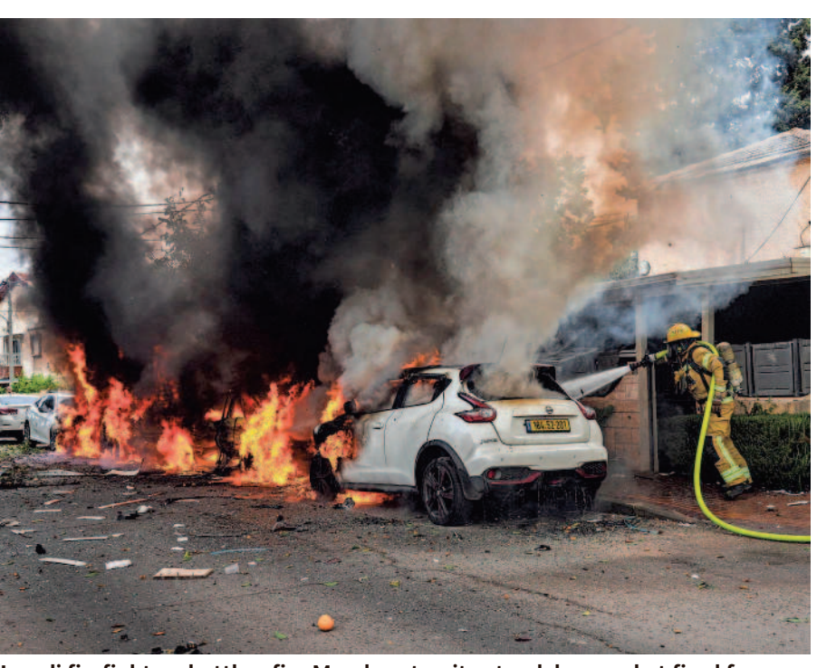
Israeli firefighters battle a fire Monday at a site struck by a rocket fired from the Gaza Strip in Ashkelon, southern Israel.